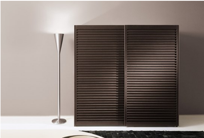
design: Pietro Arosio

The internal fitting can be decided according to the desires of the client.